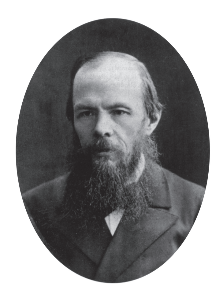
Fyodor Dostoevsky (1821–81)