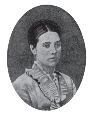
Apollinaria Suslova, Fyodor's mistress